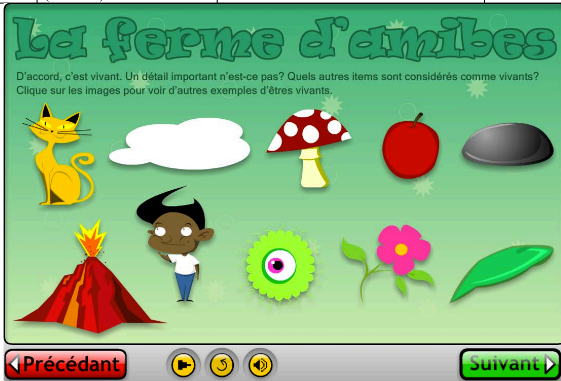
Figure 2 - ELO1358760