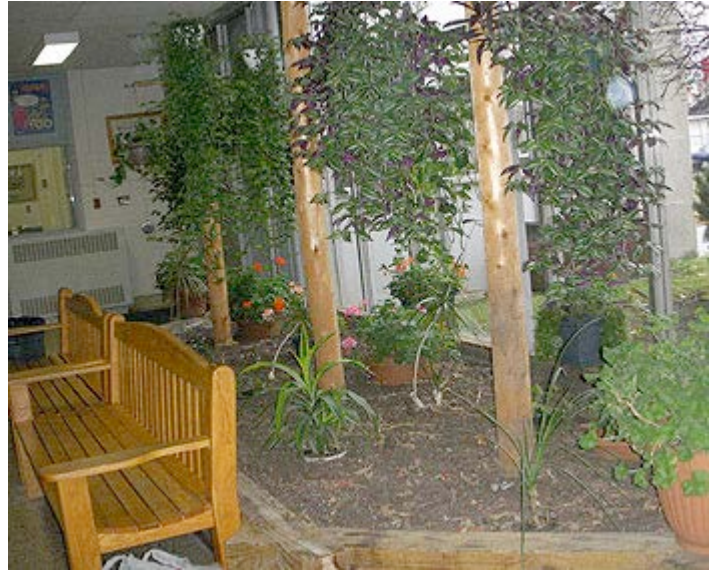
Queen Elizabeth School's inviting foyer is a constant reminder that Greening the Earth is important!

“Everything you do can make a difference”