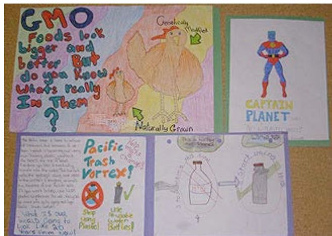
QE's EarthCARE bulletin board!